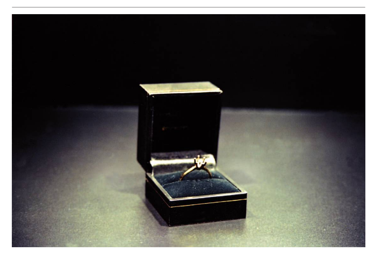
Jill Magid, Auto Portrait Pending, 2005, ring setting

But perhaps the significance of Article 12 lies in emphasising the narrative infrastructure of Magid's forays into the recesses of secrecy (into secrets both visible and inscrutable): the ways in which a close reading of the interdiction generates new spaces for writing and new figures semblances of relationships - carved or cast out of consent, the particular material Magid identifies as her medium. Advancing towards the point where the public performance of the secret borders on what it renders impenetrable, her projects do not so much unfold into that inevitability but anticipate its occurrence via detours, elegant arcs and plural correspondences that are momentary reprieves from its grip. They turn interruptions into narrative joints, orchestrating a play of perspectives and segues between what the prohibition covers and what it divulges. Rather than surmount or resist the injunction, or fail faux heroically in its invincible proximity, Magid's practice works as a particular kind of prolepsis, as saying as much as can be said in advance of a closure, enlarging and complicating the territory of artistic action.