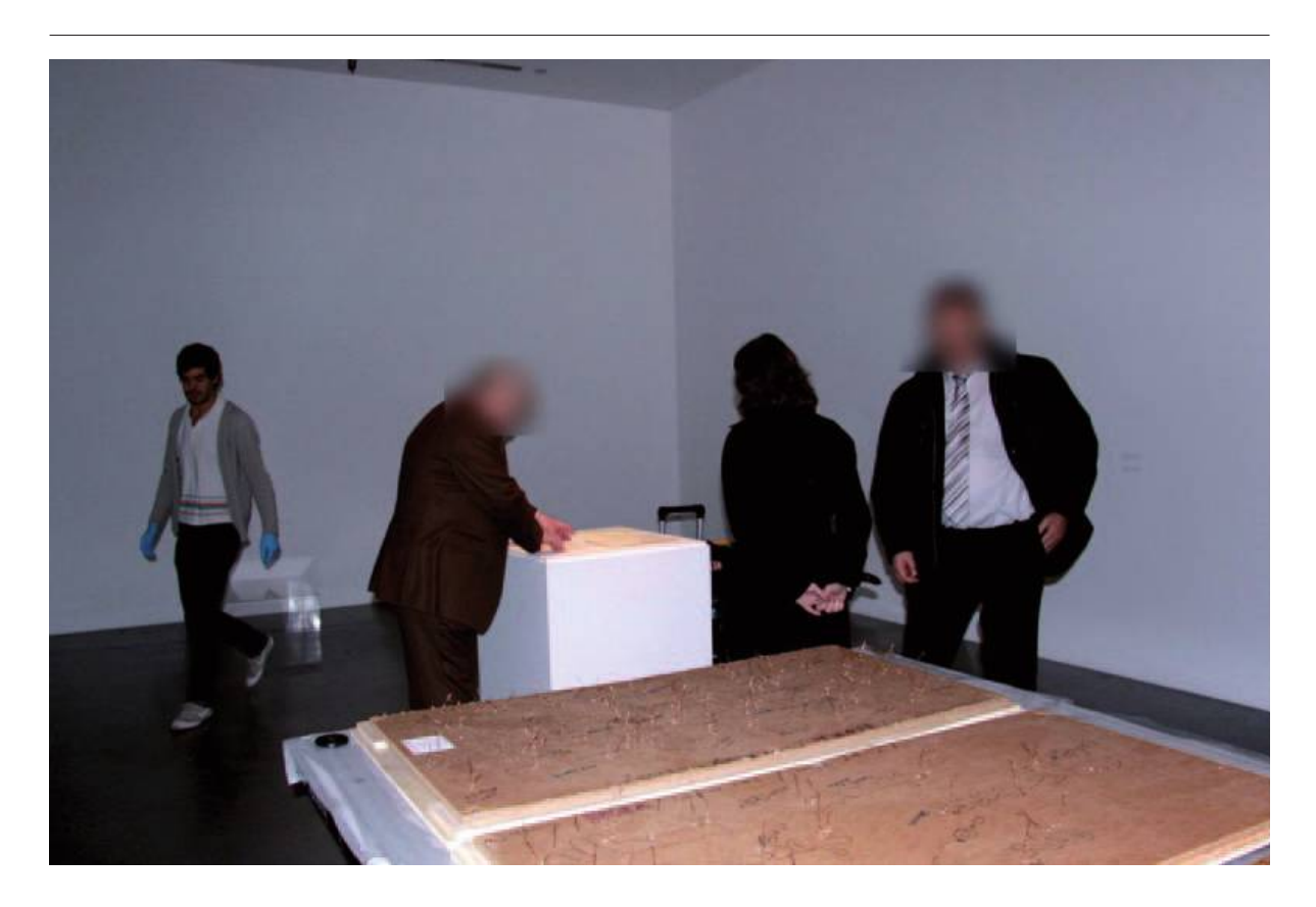
The Dutch Government confiscating the body of the book Becoming Tarden (2009) from the Tate Modern, London, 2010.

and sits in an ambiguous position vis-à-vis the works that constitute Article 12 ; it is in and out of the project, concluding it to the same extent as prompting further speculative ramifications. After consulting with lawyers, who persuaded her that because a confidentiality agreement with the AIVD had never been signed the agency's barrage of intimidations had no judicial grounds, Magid published Becoming Tarden in 2010. <sup>4</sup> For a work