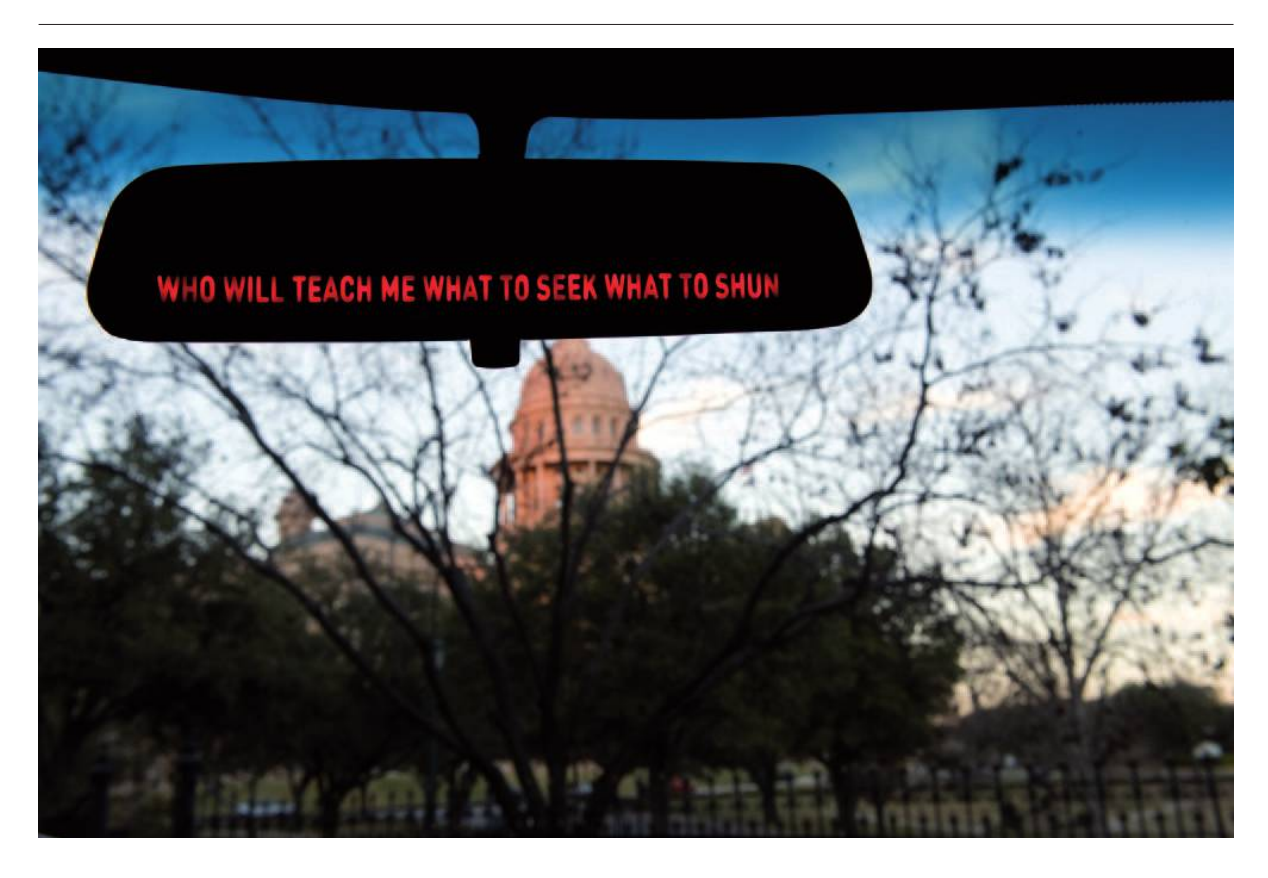
Jill Magid, Failed States, 2011, 1993 Mercedez Benz 300TE station wagon armored at B4 level, detail. Installation view, Texas State Capitol, 2011

or prescribes and the protocols of sensemaking against which it clashes.