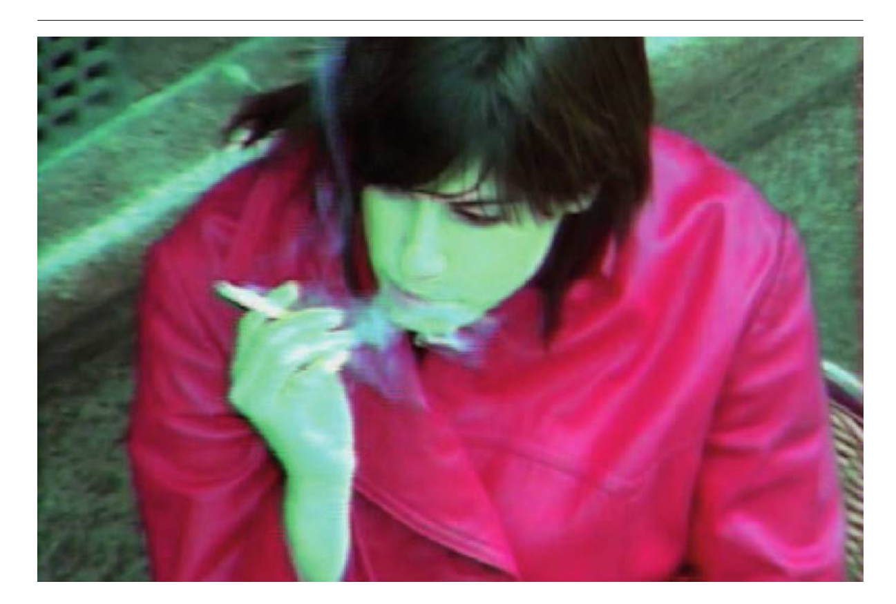
Jill Magid, Trust , 2004, video, colour, sound, 17min, still

the expansion, testing and reconfiguration of the boundaries between what is acceptable and what is not. That discrepancy intimates another 'body' of operations which naturalise and suppress, fabricate, frame and avert danger, determining the terrain over which the institution can adjudicate, and beyond whose confines lie the deviant and the monstrous.